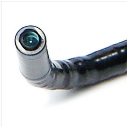
chip on the tip with precise optics